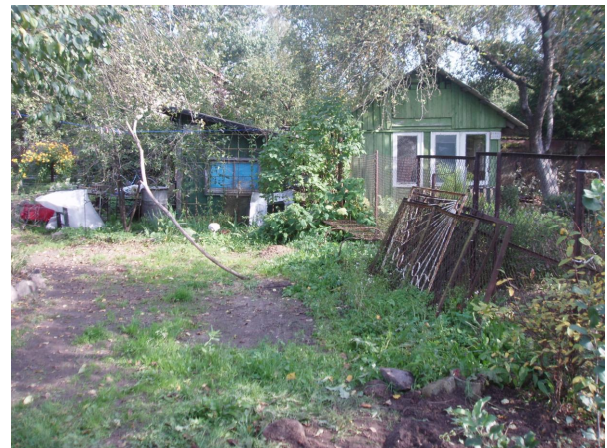
Fig. 4. Urban allotments in Riga, Latvia.

As historically allotments were formed on the territories of Riga city in the places where the capital construction was possible only with additional costs because of the ground problems. The allotments were not planned taking into consideration the suitability of ground, water and air quality for producing fresh food. When the construction industry and methods developed became possible to make constructions in vacant territories and most of these territories are provided from allotments.