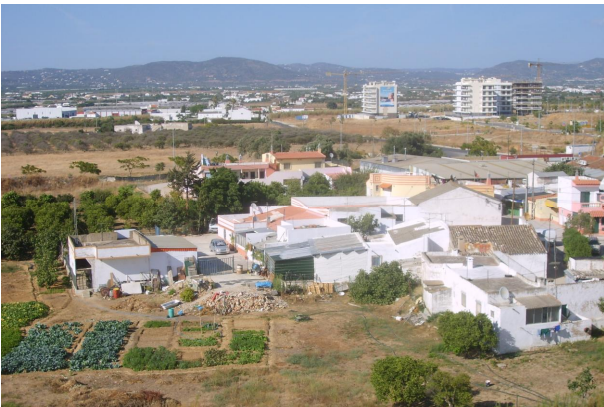
Fig. 1. Urban agriculture in Faro, Portugal.

Historically urban agriculture draws on the model of the Italian villa, which was a productive villa in the periphery of the city. The villa Medici in Rome conserves traces of the Lucullus gardens. The villa Lante in Bagnaia, also Italy, has a part which is a urban forest apart of the formal garden with water plays, just to name two personally visited examples. Current structural funds European projects of Nicolas Triboi (Atelier Foai Verde) in Romania build on this model in providing urban agriculture instead of dense housing neighbourhoods (see Bostenaru, 2015 for an example near Bucharest). Also in contemporary Italy the issue is not foreign to the research. Michele Nori from the European University Institute is looking into rural pastoralism today, as well as Roxana Triboi from Romania in the doctorate work.