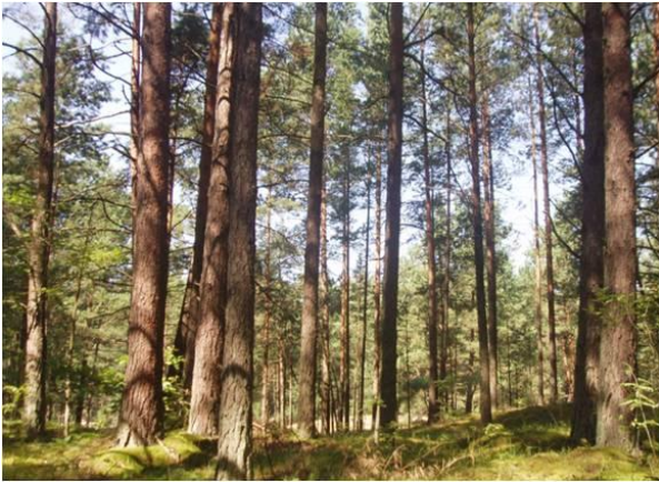
Fig. 2. A close view of a forest in Riga city.

According to Nilsson et al. , (2011), the factors contributing to poor health of city dwellers are: an increasingly sedentary population, increasing levels of mental stress associated with modern urban life, work practices and hazardous environments, such as air polluted. The natural areas and natural features like forests and trees are recognized as capable of providing conditions to improve those negative factors. Stress and related conditions, as reflected in medical records, have increased dramatically among adults and children in Western societies (Grahn and Stigsdotter, 2003). In the process of improvement of urban environments, it is essential to facilitate the access to local green areas that can relieve environmental stress and provide conditions for rest and relaxation, as well as seeking to reduce levels of traffic noise (Gidlöf and Ohrstrom, 2007).