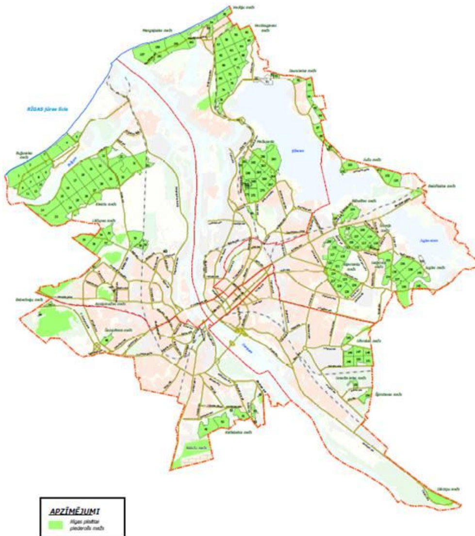
Fig. 3. Riga's urban forests.

Apart of hosting an Art Nouveau and Ecology meeting and exhibition, Riga recently hosted also a meeting on Intelligent Management of Heritage Buildings COST meeting, looking into integration of buildings in their surroundings (leading the working group). Earlier on, it hosted on on sustainable development in digital representation, with focus on transport. Making periurban green space accessible is a challenge for transport systems in the city, and these include the holiday resort.