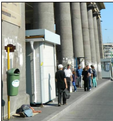
Fig. 3. Pedestrian space - Sala Palatului area