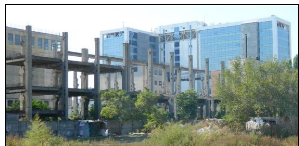
Fig. 6. Vacant space - Industriilor area