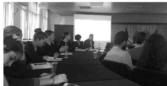
Fig. 2. Image during the Opening Conference, Council Hall, UAUIM, Bucharest, 18 th May 2019