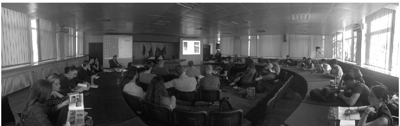
Fig. 3. Image during the Opening Conference, Council Hall, UAUIM, Bucharest, 18 th May 2019